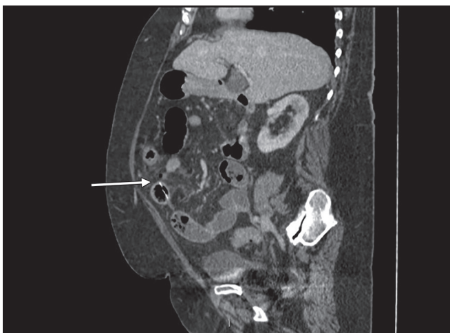
Fig. 3: A sagittal CT image demonstrating the bread bag clip (indicated by the arrow)

The patient was resuscitated, given intravenous antibiotics, and underwent laparotomy on the day of admission. A small bowel run was performed, demonstrating perforation of the bowel wall in the midileum at the site