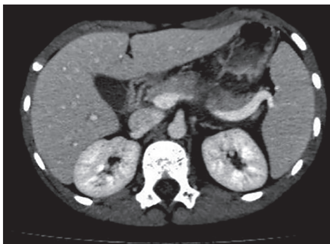
Fig. 1: CT demonstrating pancreatic duct injury

(ERCP) can diagnosis up to 100% of the duct lesions (Bhasin, 2009). 15 However, such a modality is restricted to some specific trauma centers. Magnetic resonance cholangiopancreatography (MRCP) is also an alternative method, which is more accurate than the CT exam, but depends on the sedation of pediatric patients. Again, this procedure is not available in all hospitals (Nirula, 1999). 16 CT images that corroborate with the pancreatic duct lesion are deep lacerations and pancreatic transection (Fig. 1). 17 It should be noted that the CT accuracy increases depending on the moment in which the CT was performed. Therefore, more recent CTs may not fully reveal the pancreatic lesion. In these cases, it is advisable to repeat the CT 12 hours later, when the CT accuracy is more reliable (Rekhi, 2010; Sheikh, 2015). 17,18 In the hospital where this study was conducted, the CT is used as an initial method of choice for all cases. The ERCP is not entirely available at the João XXIII Hospital, but, if necessary, it can be performed in partner hospitals.