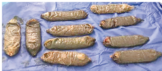
Fig. 2: Foreign bodies removed during a laparotomy