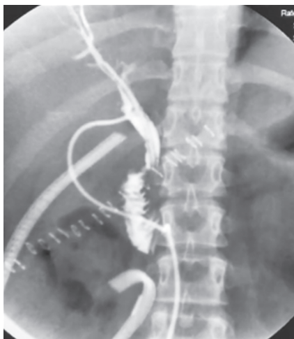
Fig. 3: T-tube cholangiography on day 9 after reoperation. Passage of contrast into the duodenum is visualized

to be a good treatment option at some hospitals in developing countries and for a certain subset of patients (previous surgery with dense adhesions, aberrant biliary ductal anatomy, failed ERCP). 8